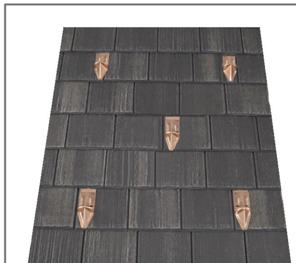
FIGURE 1 - Example Pattern