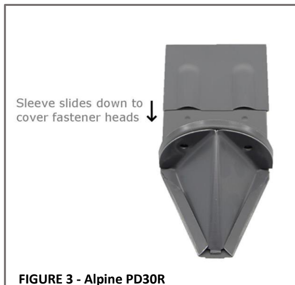
FIGURE 3 - Alpine PD30R