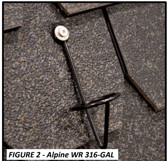
FIGURE 2 - Alpine WR 316-GAL